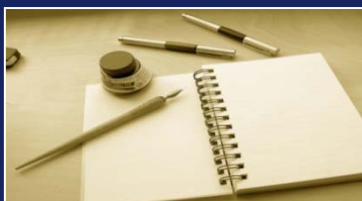
Academic Writing: Improve your writing and relieve the stress of your workload

For additional information, click the Writing Programs link on our website