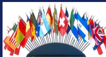
Writing for Multilingual Speakers: Master your English writing skills